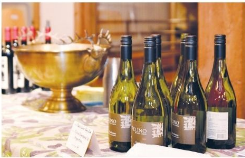
Wine About Winter