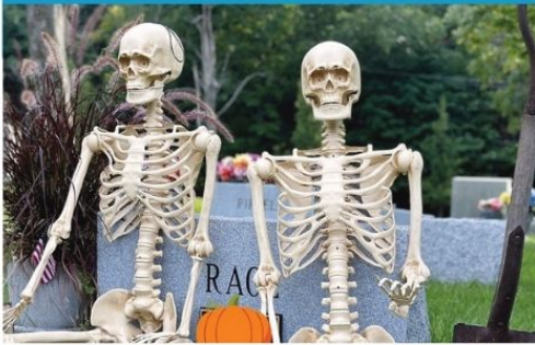
Bones About Town